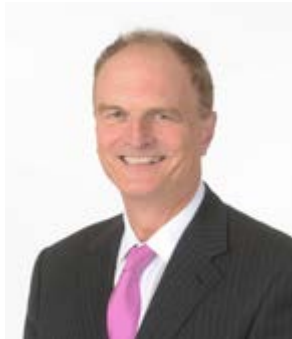
Charles V. Firlotte Chair