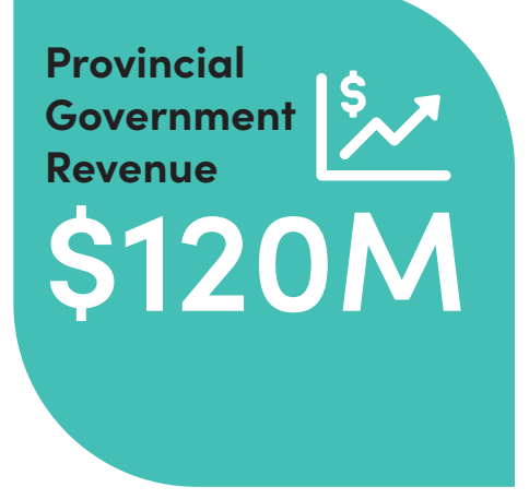
Direct and Indirect in New Brunswick