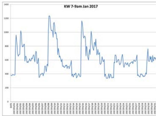
Profile B – Not Accepted