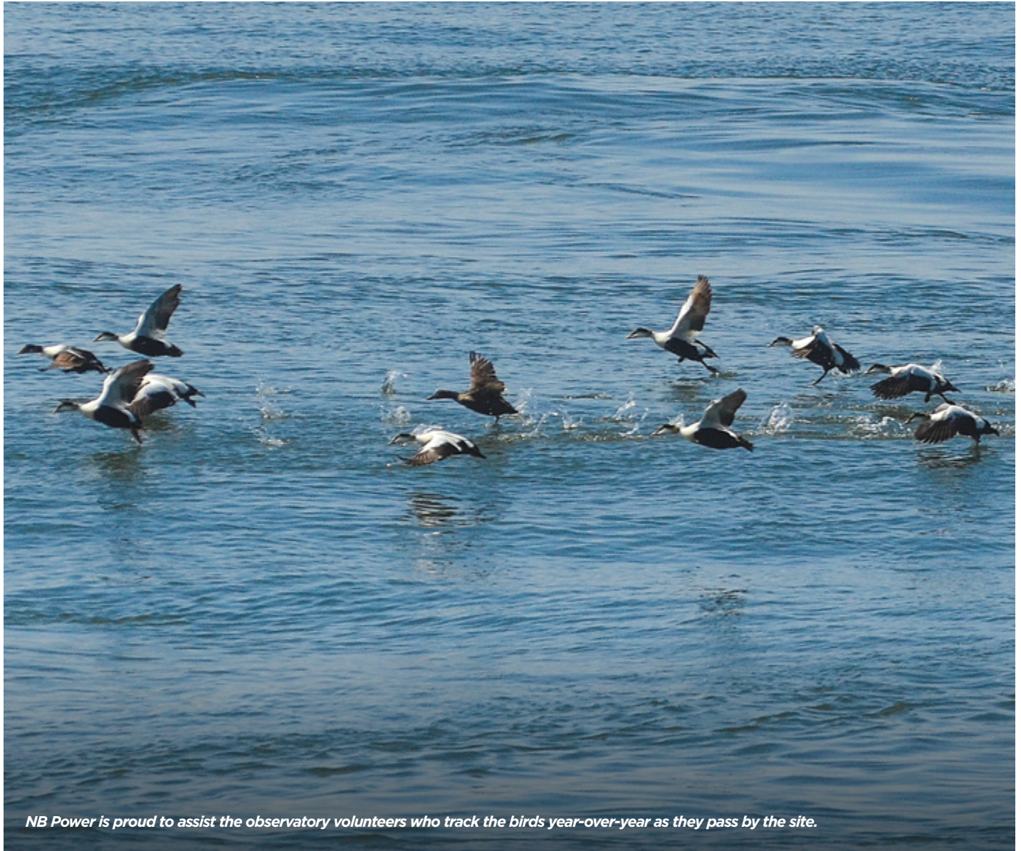
NB Power is proud to assist the observatory volunteers who track the birds year-over-year as they pass by the site.

THE MIGRATION HABITS OF SEABIRDS ARE IMPORTANT ECOLOGICAL MARKERS